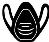
Protective Clothing Pictograms